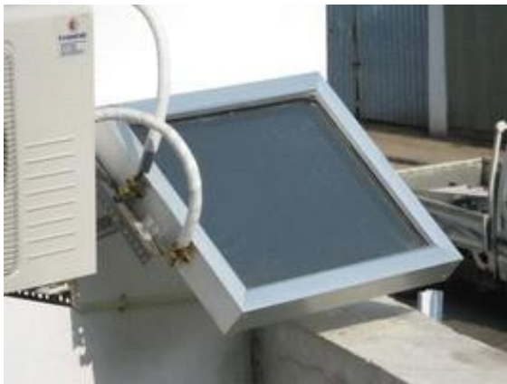
Our Solar AC used in Dubai office