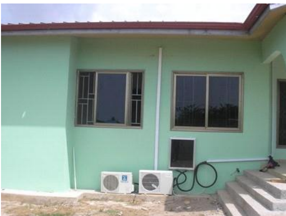
Our Solar AC used in Africa office