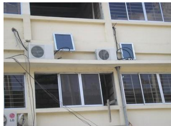
Our Solar AC used in Africa factory