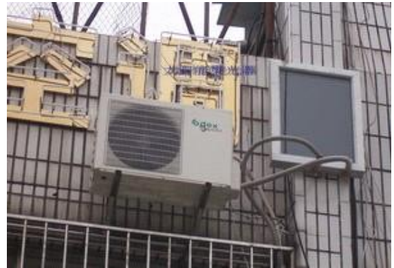
Our Solar AC used in Chinese factory