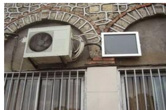
Our Solar AC used in Africa office