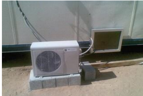
Our Solar AC used in Dubai Manager Cabin