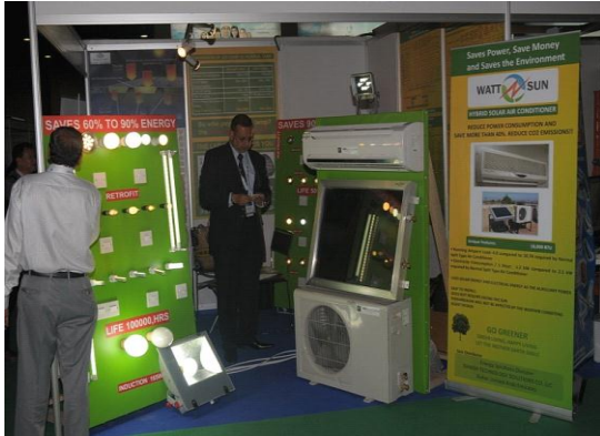
Our Solar AC showed in Dubai International Fair