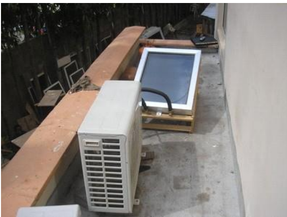
Our Solar AC used in Africa hotel