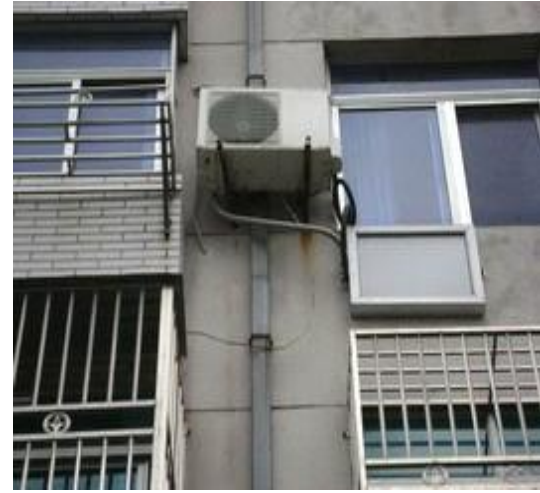
Our Solar AC used at home