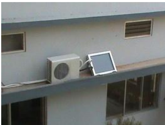
Our Solar AC used in Africa building