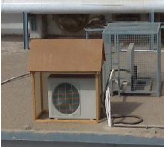
Our Solar AC used in Indian building