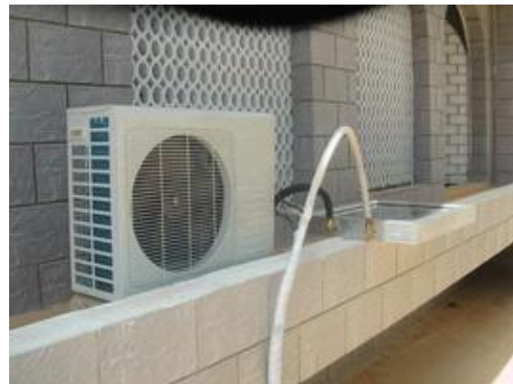
Our Solar AC used in Sharjah building