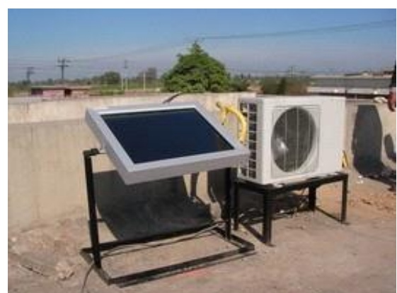
Our Solar AC used in Pakistan family