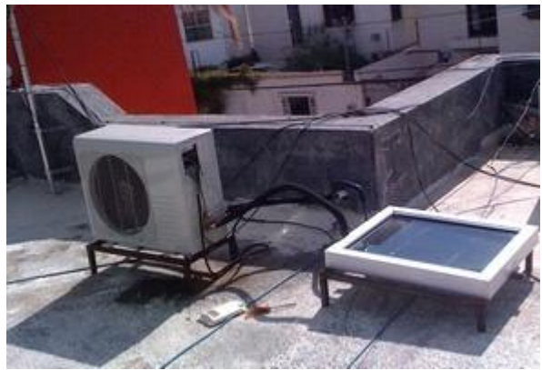
Our Solar AC used in Mexico building