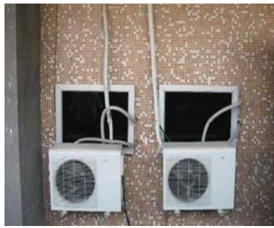
Our Solar AC used in Sri Lanka company