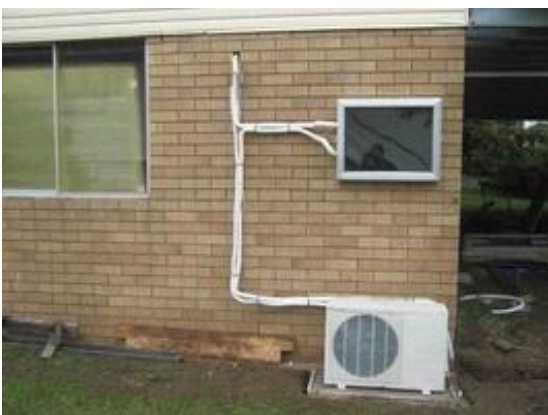
Our Solar AC used in Australia family