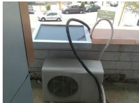
Our Solar AC used in Japan office