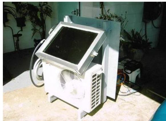
Our Solar AC used in Panama building