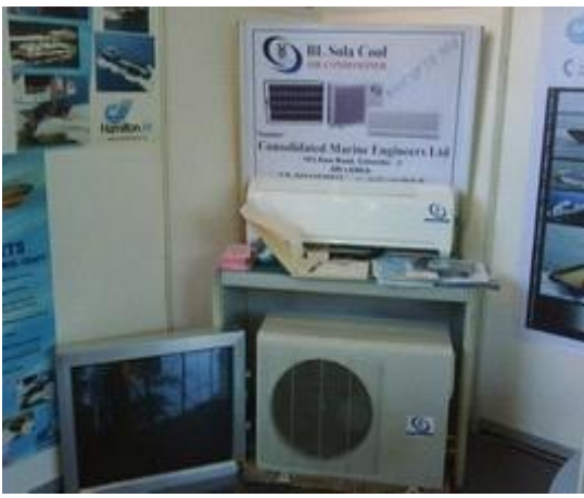
Our Solar AC showed in International Fair