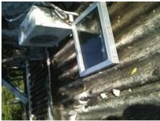
Our Solar AC used in Honduras office