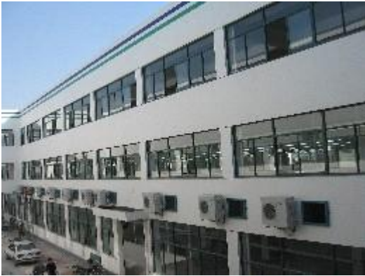
Our Solar AC used in Chinese factory