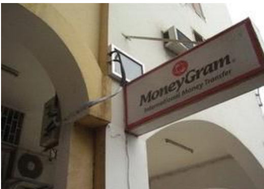
Our Solar AC used in Africa bank