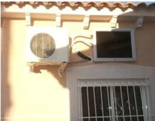
Our Solar AC used in Spain family