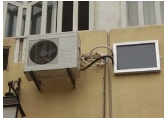
Our Solar AC used in Africa building